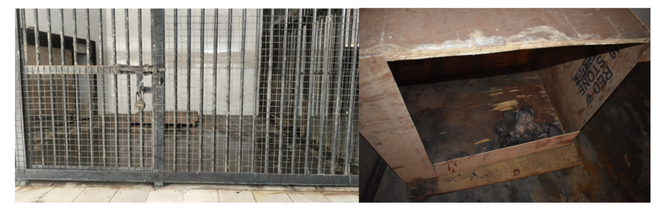
Figure 3. The images showcase the off display facilities of the night cells/retiring cells, which have smooth flooring and wooden framework specifically designed for dhole parturition and rearing of puppies at the time of first litter.

houses to ensure adequate grip and alleviate discomfort while walking. Furthermore, a small section of the night house could be constructed with natural substrate, or advanced flooring systems such as bio-floor could be implemented.