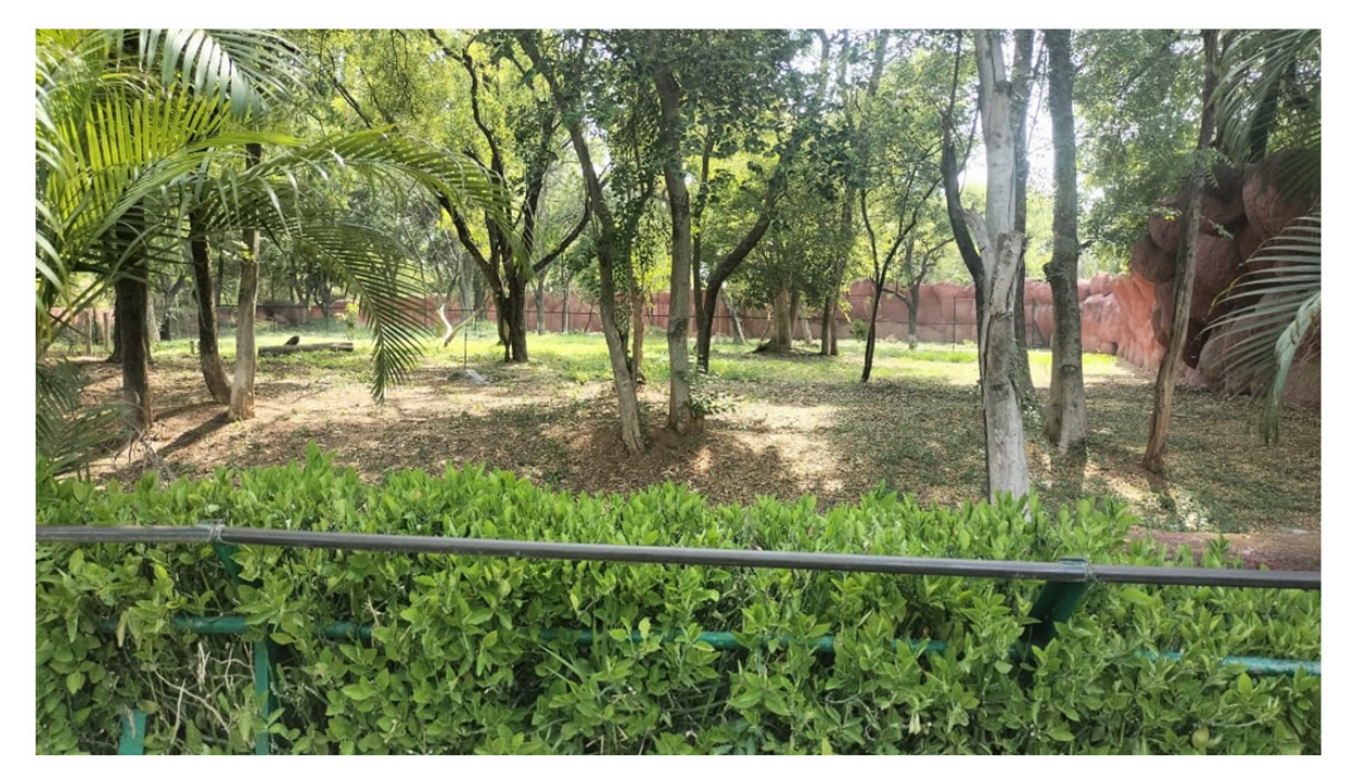
Figure 1. The naturalistic display enclosure for Dholes at Nehru Zoological Park, Hyderabad.