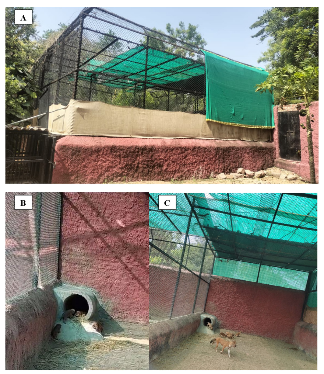
Figure 4. Day kraal A) outfitted with Jute Gunny Cloth and Green Shade Net to obscure keeper disturbance B) A cavernous den filled with dry hay grass C) day kraal with sufficient sunlight and soil substrate, where puppies are playing with their mother

Furthermore, cavernous dens provide better protection from predators and extreme weather conditions compared to earthen dens, which require more energy to excavate (Comley et al. 2023). This indicates that our efforts to align with their natural den site selection have led to improved reproductive success. Additionally, the captive conservation breeding program for dholes at Indira Gandhi Zoological Park in Vishakapatnam has shown increased breeding success with the use of cavernous dens (unpublished data). Therefore, this study recommends providing suitable hides or cavernous dens to fulfil the ecological requirements of dholes and enhance their breeding performance. Future enclosure designs for canids should consider dens as an essential component of enclosure features.