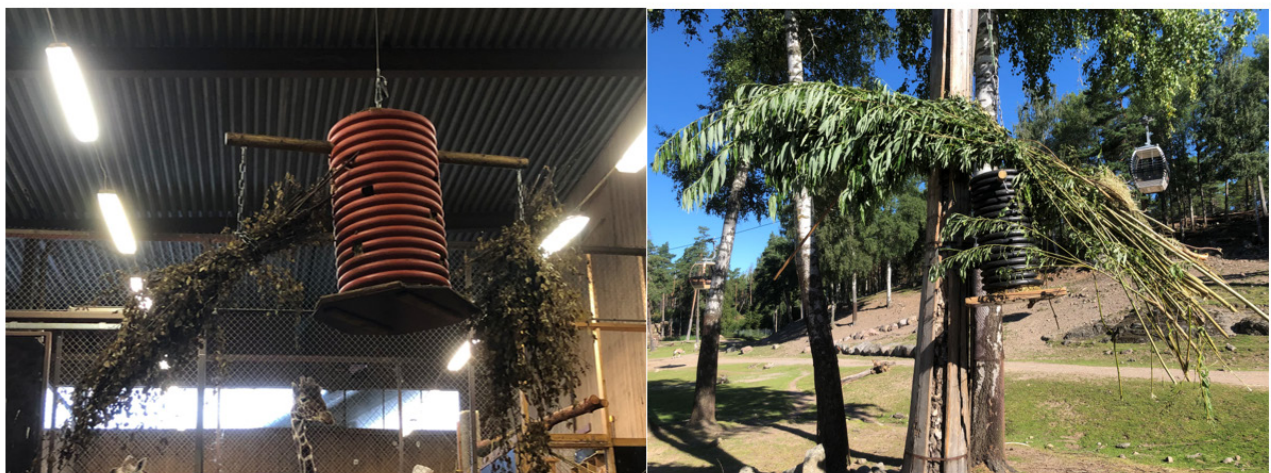
Appendix 3. Slow feeding barrels