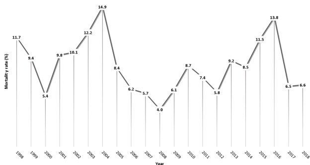
Figure 1. Mortality rate per year of captive jaguars Panthera onca in the European breeding population between 1998 and 2018. Mortality rate (%) was calculated as the number of animals that died each year divided by the total number of animals that lived during the same year.

More than half of the deaths (51.4%, 106/206) occurred in geriatric animals. Cubs had the second highest proportion of deaths (22.8%, 47/206) and 19.4% of deaths (40/206) were from the adult group. Juveniles and young adults accounted for the lowest number of deaths, with 3.8% (8/206) and 2.9% (6/206), respectively. To further analyse cub mortality, data from 207 cubs born in 124 litters from 1998 to 2018 were analysed. The GEE found that cub survival was not significantly affected by parity, maternal experience or litter size (Table 1). The distribution of litters related to dam parity can be seen in Table 2. Litter size ranged from one to four animals; 50% (62/124) of the litters had only one cub, while 33.8% (42/124), 15.3% (19/124) and 0.8% (1/124) of the litters had two, three and four cubs, respectively.