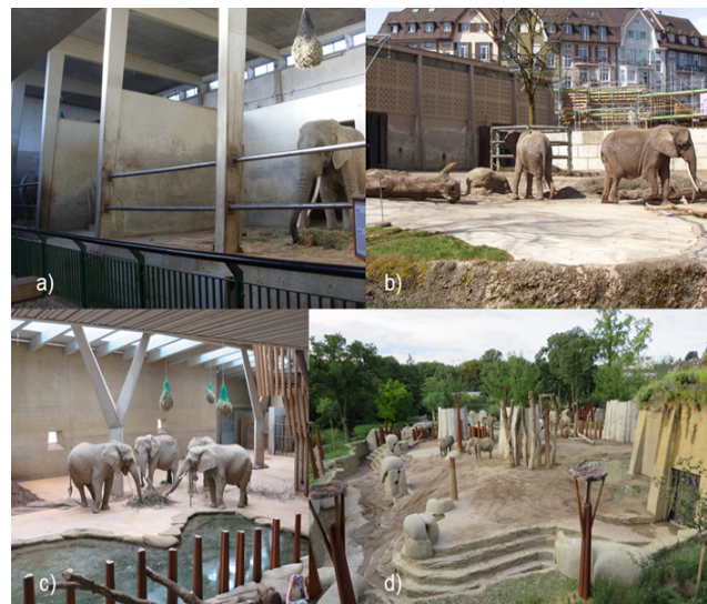
Figure 1. Comparison of the old and new African elephant exhibit at Zoo Basel. Old indoor (a) and outdoor (b) exhibit during the first period of observation and both areas of the new exhibit (c,d) during period 4 and 5 of observation.

evidence by specific reports (Braidwood 2013; Jacobs 2011; Lucas and Stanyon 2016; Thomas et al. 2001), uncertainties concerning the expectable effects of a new exhibit on stereotypic behaviour of an elephant remain. The present case report aims to (I) document changes in the amount of swaying in an elderly female African elephant ( Loxodonta africana ) during and after the reconstruction of a new elephant exhibit at Zoo Basel. Additionally, (II) potential influencing factors were assessed to identify parameters that might be most critical. Ideally, consideration of these parameters may provide further helpful advice to elephant-keeping facilities in optimising their husbandry conditions.