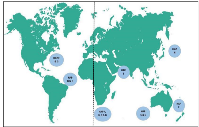
Figure 3: Geographic distribution of nine of the 10* sand tiger shark mtDNA haplotypes. A west–east hemisphere division is indicated by the dotted line. *As haplotype K was acquired from an aquarium, its global origin is unknown though it is closely related to haplotypes F and G.

Of the 36 separate DNA extraction attempts, PCR was successful on 16 teeth (44.4% overall success rate). These figures are similar to those of Ahonen and Stow (2008). Following sequence editing, 520bp of the hypervariable D-loop region was identified from the 16 successful amplifications. Following the nomenclature of Ahonen and Stow (2008), four total haplotypes were revealed, namely B, F and G, and a new haplotype (K). These data were supplemented with the haplotypes identified by Ahonen et al. (2009) and Chang et al. (2015) (here labelled haplotype J) resulting in 10 haplotypes defined by 16 polymorphic sites (Figures 1 and 2). The novel sand tiger shark haplotype (K) found in a sample from Georgia Aquarium differed by one mutational step from haplotype G.