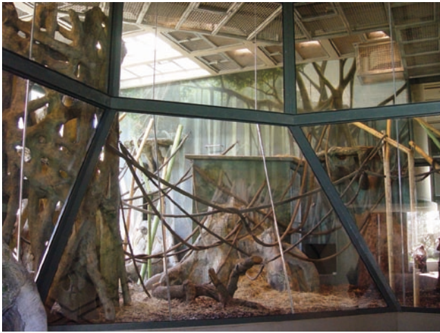
Figure 1. The chimpanzee exhibit in the Regenstein Center for African Apes, Lincoln Park Zoo as viewed from the public area.

categorised as environmental enrichment devices (EEDs). EEDs are objects intended to elicit species-specific behavioural responses from animals as well as to extend foraging time and encourage problem-solving (Shepherdson 1998; Markowitz 2011; Young 2013). EEDs are constructed from a variety of materials and may range from being very artificial in appearance to being relatively naturalistic, which may in turn influence visitors' perception of those elements (Perdue et al. 2012). The degree to which these items appear naturalistic in appearance may depend on the materials they are constructed from, the nature of the device and the institutional policy about maintaining the naturalistic aesthetic of the overall environment on display to the public. Due to the observed importance of naturalistic exhibits (Ogden et al. 1990; Coe 1992; Markowitz and Aday 1998; Stoinski et al. 2001; Davey et al. 2005; Ross et al. 2011), zoos often aim for cohesion in the appearance of the exhibit and any temporary elements provided to the animals.