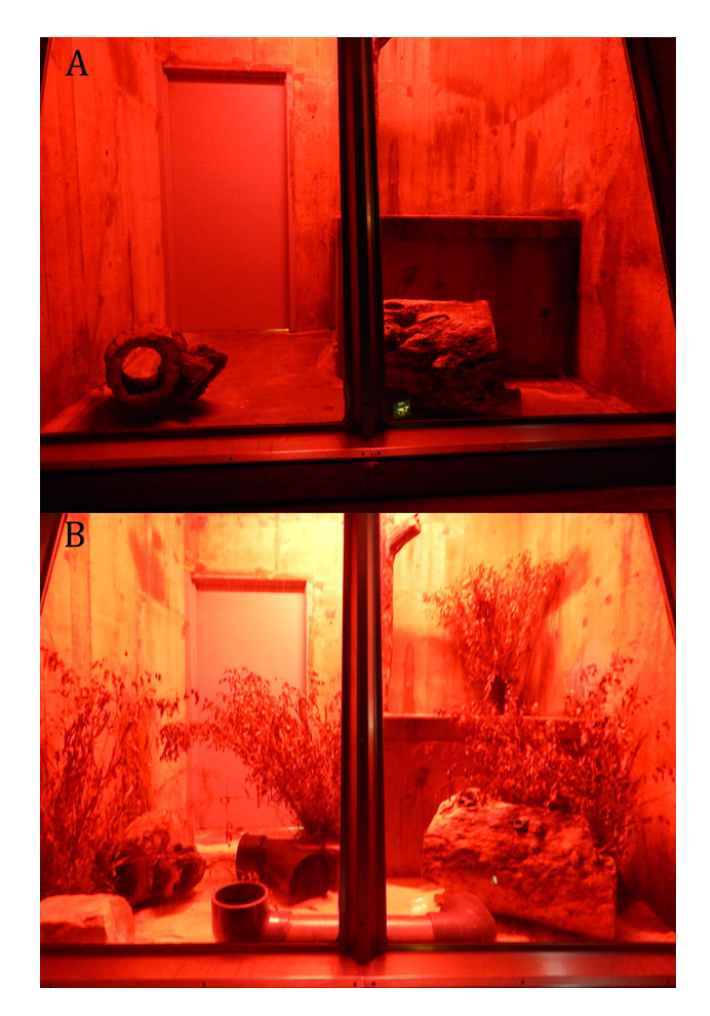
Figure 1. The subject's exhibit prior to (A) and following (B) exhibit modifications. The subject's off exhibit holding space is located underneath the raised concrete platform in the back right corner of the exhibit.

This study was conducted for 10 months from July 2013 to April 2014 and a total of 67.7 hrs of behavioural data were collected. Data were collected at least once per week (average of 3.1 observation days per week and 6.0 observations per week). For days that had multiple observations (average 1.8 observations per day), data were always collected during different one-hour blocks (i.e. 1000–1100, 1100–1200, etc.). Data collection was scheduled to occur evenly between the morning (0800–1200) and afternoon (1200–1500), but due to exhibit cleaning in the morning that was at a variable time each day, 61.6% of observations were