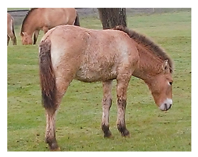
Figure 1. Clinical presentation of the Przewalski foal, with sudden-onset progressive weakness including sweating, an unresponsive demeanour and repeated stretching of the neck as if dysphagic.

sample was taken from the jugular vein, and the foal was given 33 mg butylscopolamine (Buscopan compositum®, Boeringher Ingelheim), 2548 mg amoxicillin trihydrate (Clamoxyl LA®, Pfizer), 102 mg meloxicam (Rheumocam®, Chanelle), 680 mg \alpha -tocopheryl acetate (Vitesel®, Norbrook) and 1 ml of tetanus vaccine (Equilis TE®, MSD, routine vaccination) intramuscularly. To reverse the anaesthetic, 47 mg naltrexone (Naltrexone 50 mg/ml, Kyron Prescriptions) was given intramuscularly.